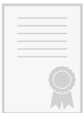
VISION 2020 MEANS 'AN ECOWAS OF THE PEOPLE'

Despite the ECPF's sophistication, many of its suggested actions and objectives are not being implemented. 37 Interviews with stakeholders revealed that more could be done to enhance the ECPF, especially on issues such as women, peace and security and the culture of peace. 38 While the framework gives ECOWAS the responsibility to rebuild, little has been done in this regard. ECOWAS is now revitalising the ECPF, recognising the importance of areas not yet implemented. It has created an internal steering committee to ensure